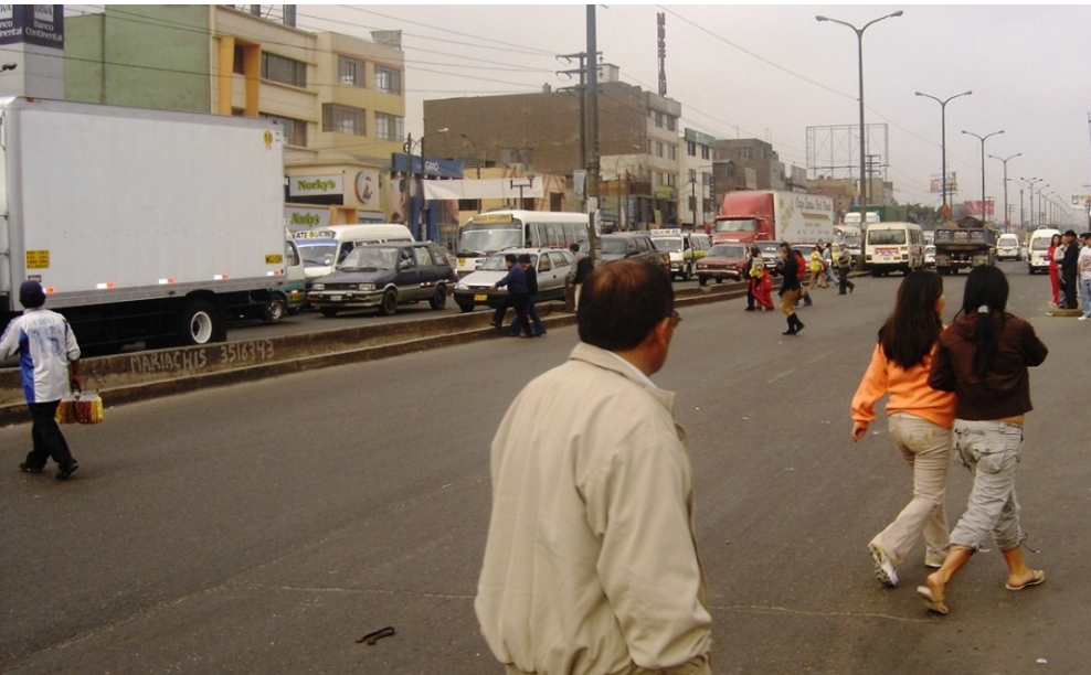
Lima - Third world