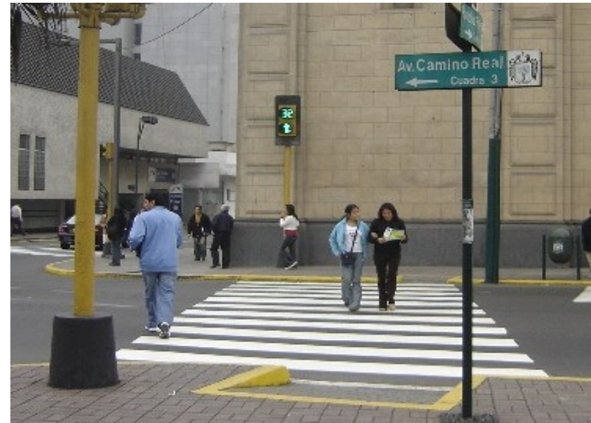
Lima - First world