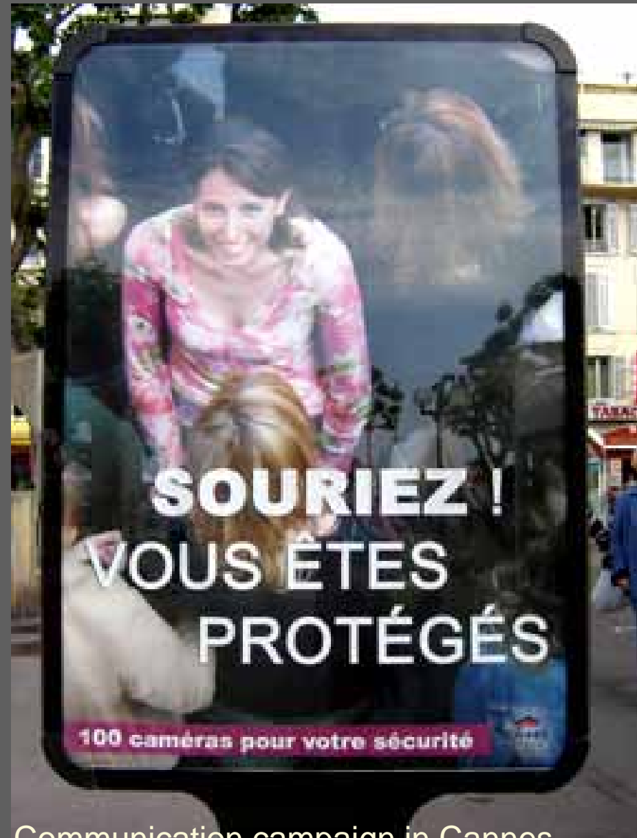
Communication campaign in Cannes, France

John Major, when UK prime Minister, Independent, 27 february, 1994